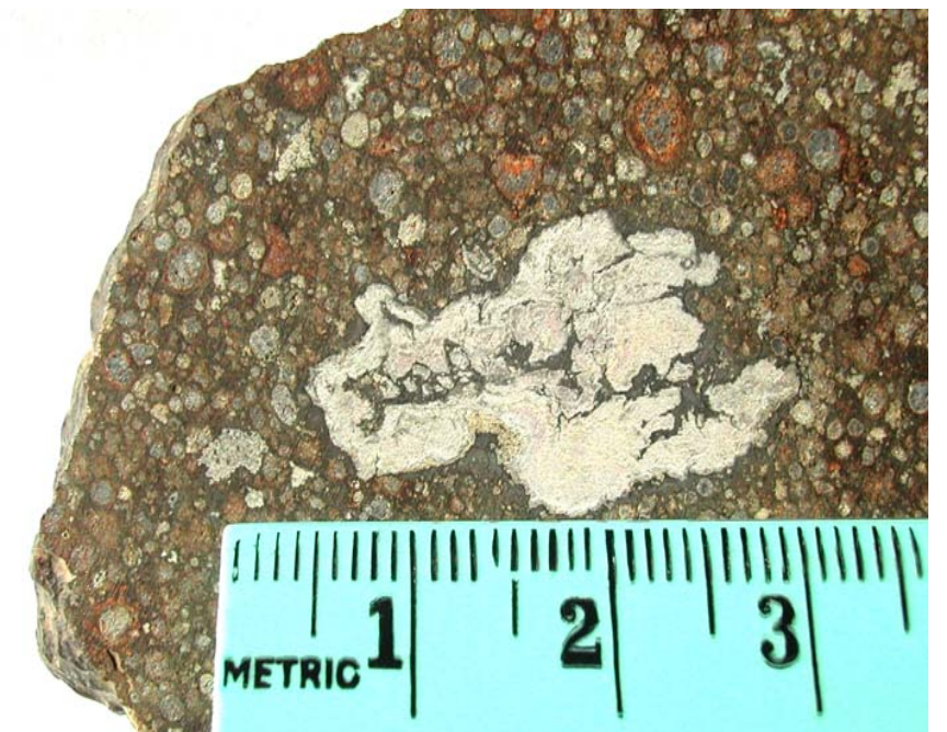
Calcium Aluminium rich Inclusions (CAIs) are light blue-grey in colour and have a fluffy texture.